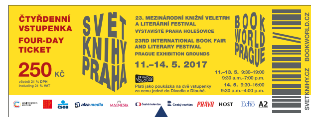
PLACING OF LOGO ON ADMISSION TICKET