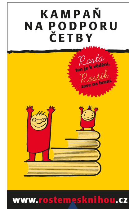
SAMPLE ADVERT 1/1