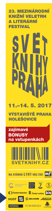
PLACING OF LOGO ON BOOKMARK