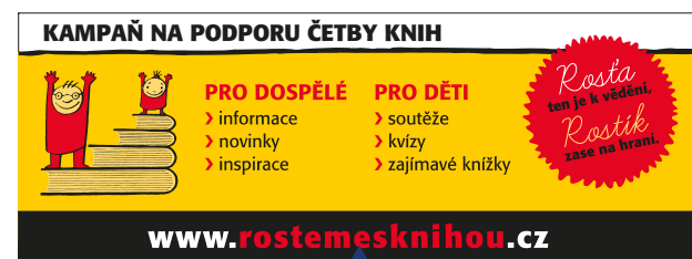
SAMPLE ADVERT ON BACK OF BOOKMARK